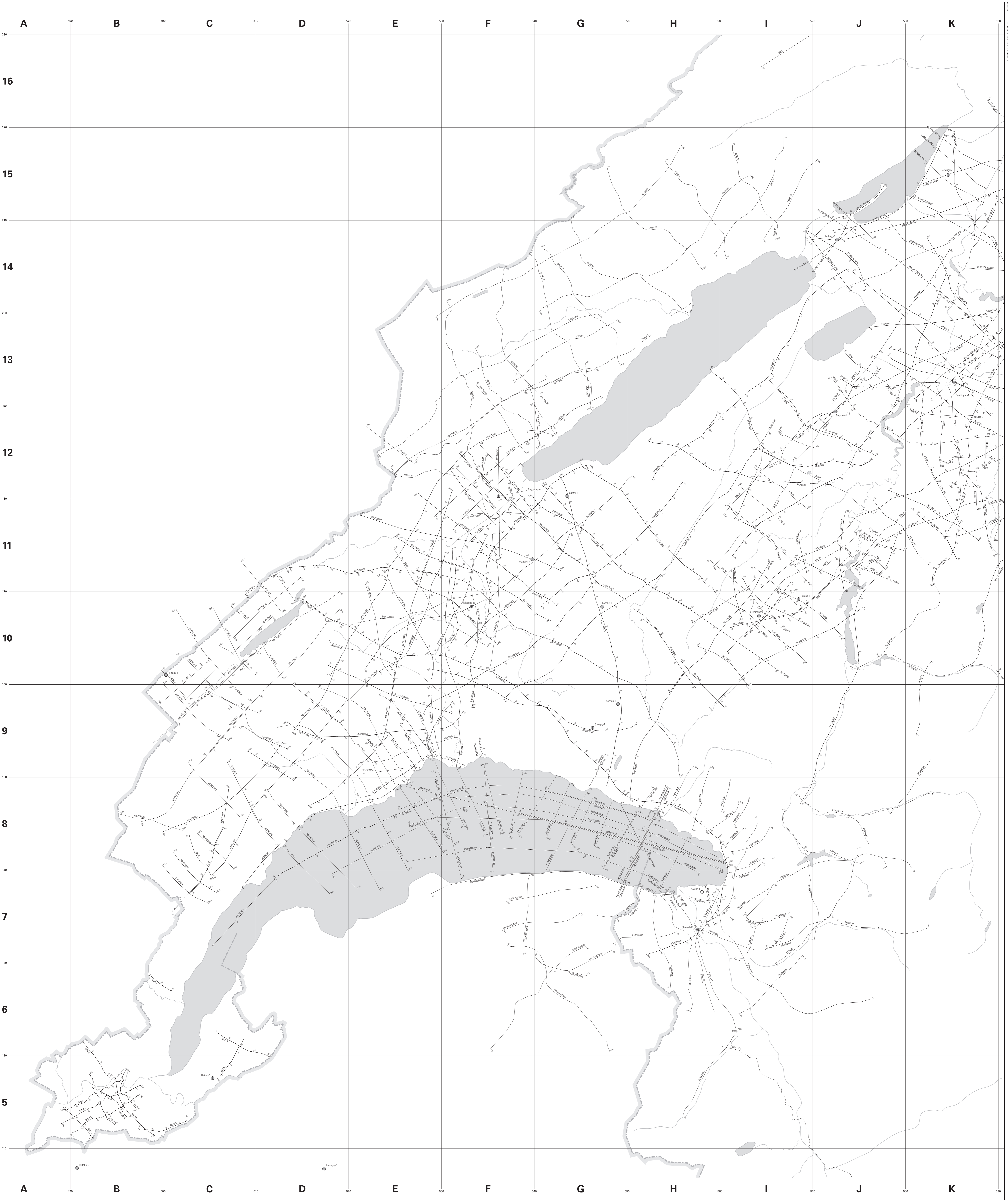
Deep seismic profiles in Switzerland with seismic location points 1:125000